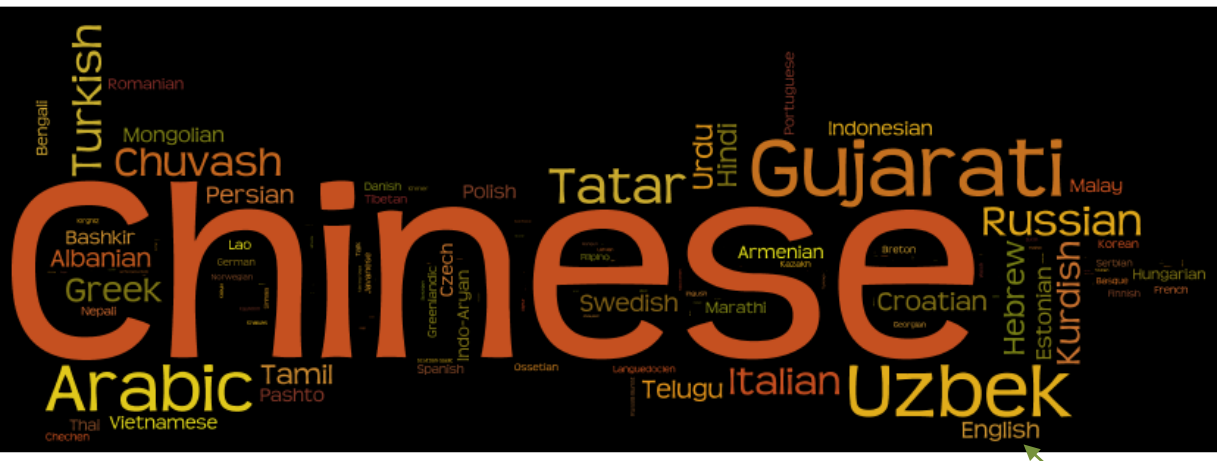
Number of given names by culture, illustrated as tag cloud (June 2015)